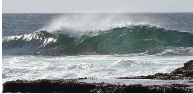
Wave off the coast of White Strand, Miltown Malbay