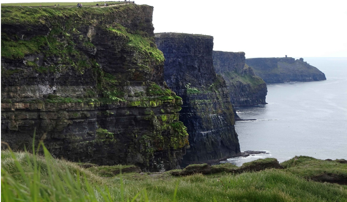
The Cliffs of Moher