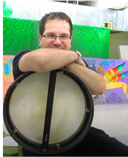
Tunes in the park, as the sun starts to set