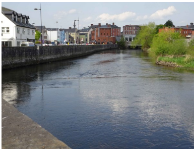
Ennis, County Clare