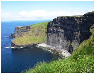
The Cliffs of Mohr