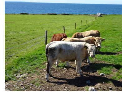
Cows on The Wild Atlantic Way