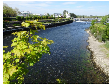
Lovely Galway City