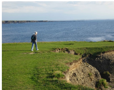
Strolling along White Strand