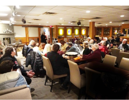
A capacity audience enjoyed the show

The Singer's Night provided the talented singers an opportunity to showcase their songs. In the past, many of the musical evenings have revolved around instrumental sessions, so it was great to let the singers loose, and hear them showcase their vocal abilities. Comhaltas Winnipeg wishes to express thanks and appreciation to the wonderful singers who volunteered to make this event a big success.